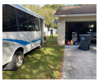
Dick Hoff (AA5NT) guiding MARV through a tight space.