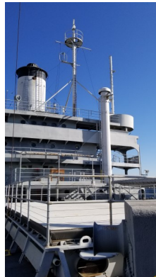
Antennas and more atop the ship.