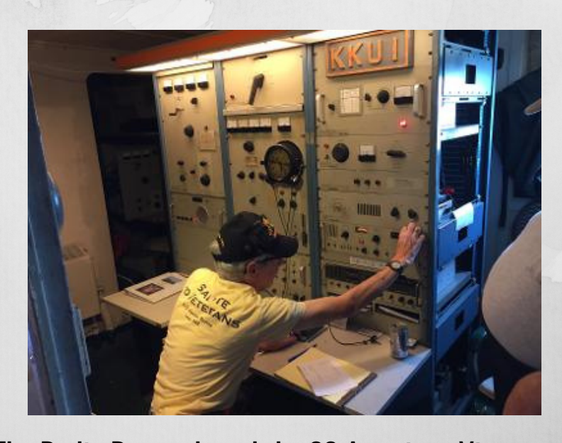
The Radio Room aboard the SS American Victory