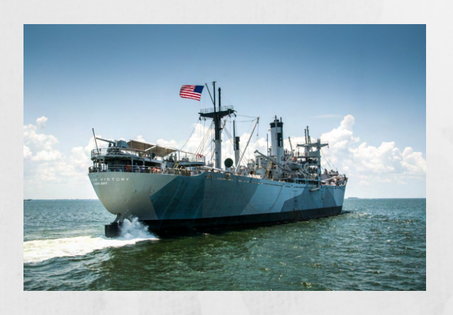
The SS American Victory

"Batten Down the Hatches! Damn the torpedoes! Full speed ahead!"