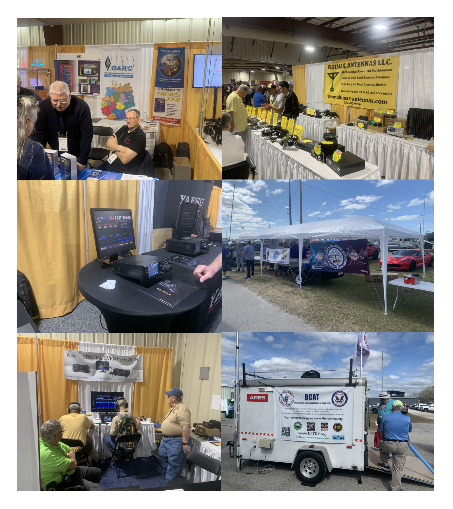
Seen above are some of the vendors: ICOM Special Events station, Yeasu vendor table, German Amateur Radio Association (DARC), antenna vendor and a example of what a future club van could look like.